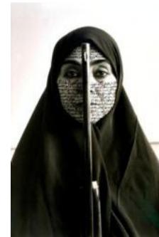
Rebellious Silence by Shirin Neshat

These essays are personal; they explore dreams and inner soul-searching, the Old Testament, traditional Indian veiling, current Amish customs, and Brazilian masking traditions. They are historical; they look at men's veiling practices throughout the world, and at visual artists' depictions of "Orientalized" women. Many are intensely autobiographical and talk about invisible veils worn to hide one's true self, or recount filmic conventions that speak to both stereotype and history; others capture social and cultural theory, discussing how wearing a veil disrupts the male gaze, and the construction of truth is explored through a look at National Geographic's search for 'the Afghan girl' who had graced its cover decades ago. Forced unveiling is explored as well and its economic, emotional, political, religious, and even military impact in Iranian history made clear. Masks and veils together in another essay are vehicles for moving between various ancient religious practices through power, myth, dance, and the construction of truth is explored through a look at National Geographic's search for 'the Afghan girl' who had graced its cover decades ago. Forced unveiling is explored as well and its economic, emotional, political, religious, and even military impact in Iranian history made clear. Masks and veils together in another essay are vehicles for moving between various ancient religious practices through power, myth, dance,