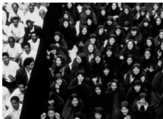
Shirin Neshat - Untitled

[Shirin Neshat, an Iranian artist who lives in New York, has explored veiling and unveiling extensively in her work as a photographer and filmmaker.]