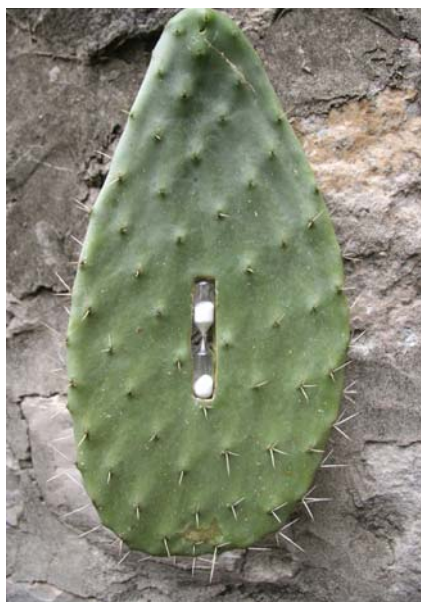
Ticktus Palestine , Digital Print, 90 h. x 60 w. cm, Edition 1/4 (2007)