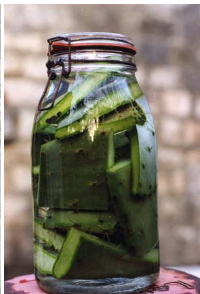
Homage to Palestine , Digital Print, 90 h. x 60 w. cm, Edition 1/4 (1999)