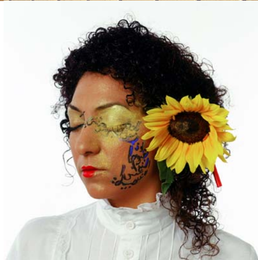
Tribute to Van Gogh , C Print, 100 h. x 100 w. cm, Edition 4/6 (2004)