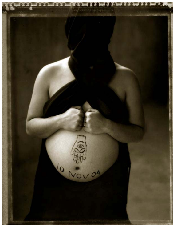
Abu Ammar, RIP , Archival Digital Print, 79 h. x 63 w. cm, Edition 4/10 (2004)