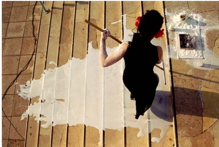
Me and Paul Klee Painting , C Print, 80 h. x 120 w. cm, Edition 3/10 (2004)