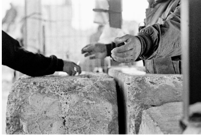
Intimacy (Installation of twelve images), B&W Digital Print, 42 h. x 72 w. cm, Edition 1/4 (2004)