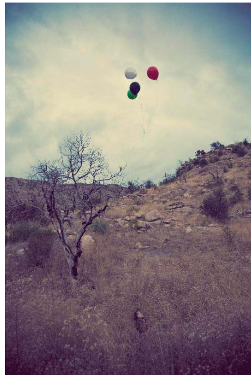
Abu Ammar, Four Years Later , Archival Digital Print, 81 h. x 61 w. cm Edition 2/8 (2008)